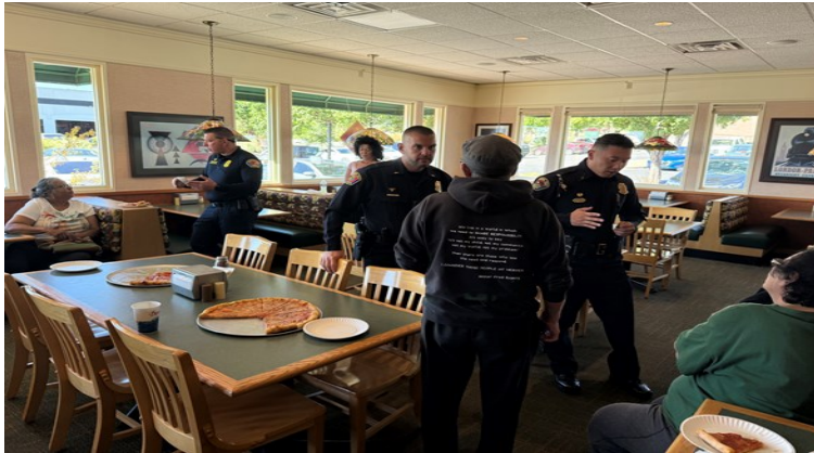
Pizza with Police at Dion's Pizza, 4200 Montano NW