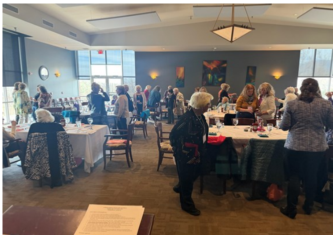
Personal safety meeting at the Four Hills Country Club, Ladies Luncheon