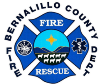
Bernalillo County Fire

https://ditchtheditches.com/swim-passes/