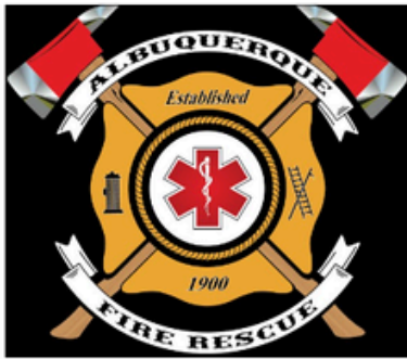
Albuquerque Fire Rescue

Please click the links for full listing of locations