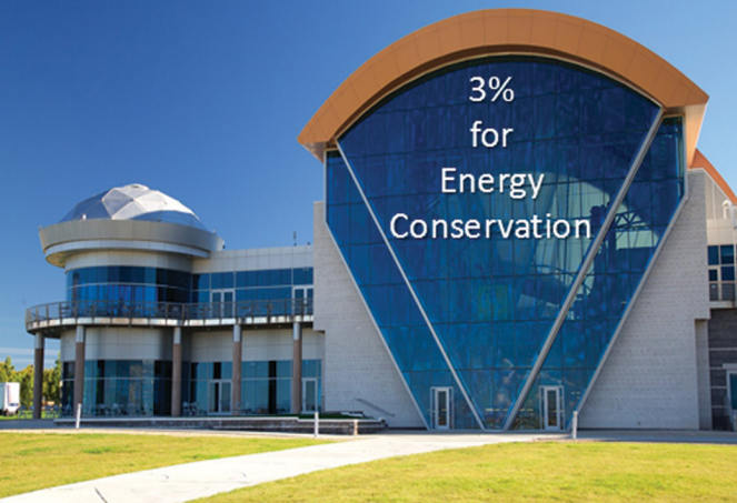
Albuquerque Balloon Museum