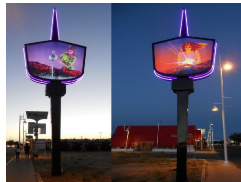
Friends of the Orphan Signs art re-creation and restoration projects in Albuquerque (Option 2)