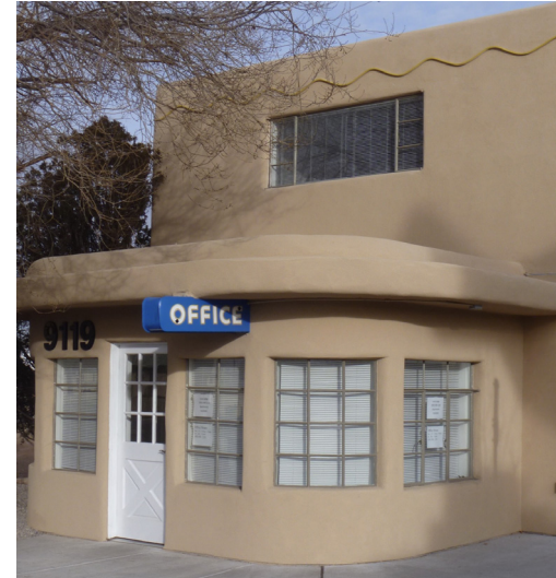
Luna Lodge AFTER Remediation