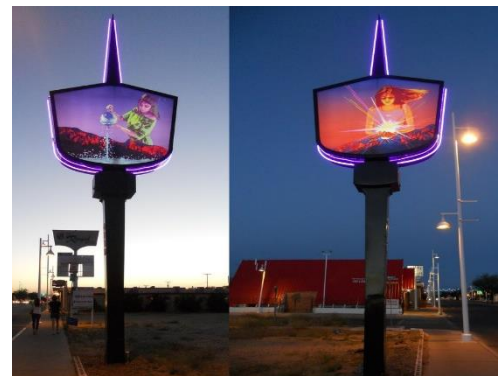
Friends of the Orphan Signs art re-creation and restoration projects in Albuquerque (Option 2)