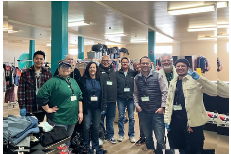
DONATION ORGANIZING EVENT AT GATEWAY WEST WITH STARBUCKS VOLUNTEERS

In celebration of Earth Day, Sam’s Club volunteers led a cleanup event outside of the shelter and collected 15 bags of litter. The first bed-building event was held on May 14th where Amazon volunteers constructed 60 new beds in the first newly remodeled dormitory.