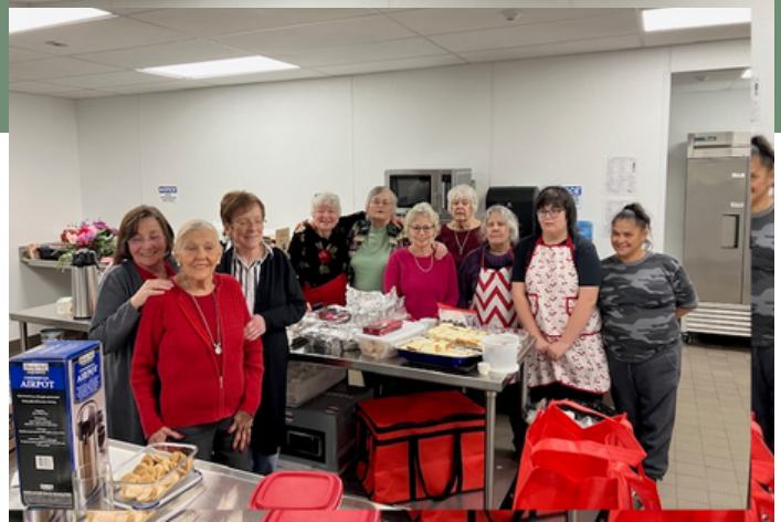
VALENTINES DAY TEA PARTY HOSTED BY HEART TO HEART VOLUNTEERS