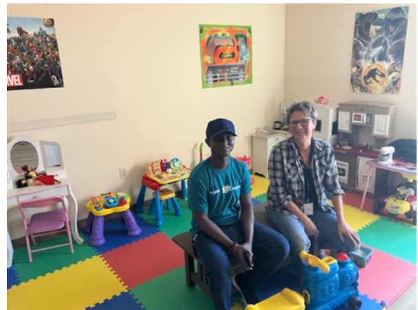
NEW CRAFT ROOMS & PLAYROOMS SET UP AND ORGANIZED BY VOLUNTEERS