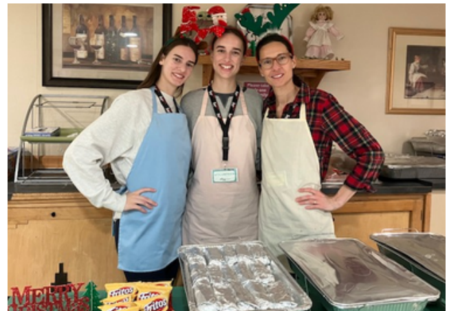
CHRISTMAS MEAL SERVICE AT FAMILY HOUSING NAVIGATION CENTER