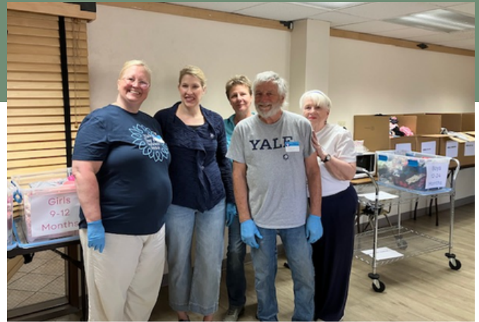
DONATION ORGANIZATION EVENT AT GATEWAY WEST WITH YALE ALUMNI VOLUNTEERS