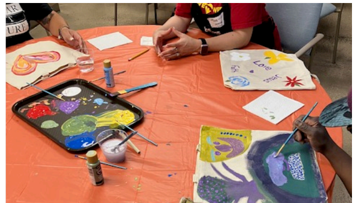
PAINT NIGHT EVENT HOSTED BY CALVARY CHURCH