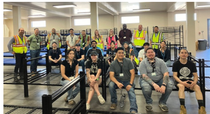
BED BUILDING AT GATEWAY WEST WITH AMAZON EMPLOYEES