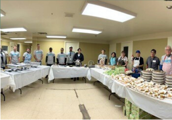
THANKSGIVING DAY MEAL SERVICE AT GATEWAY WEST