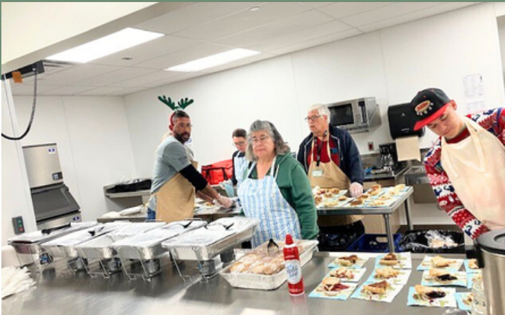
THANKSGIVING DAY MEAL SERVICE