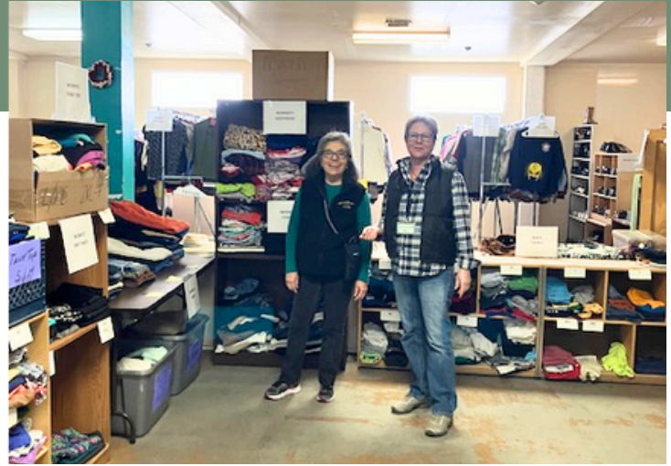
DONATION ORGANIZATION EVENT AT GATEWAY WEST WITH VOLUNTEERS