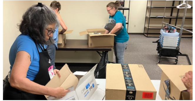
DONATION PROCESSING EVENT AT GATEWAY CENTER