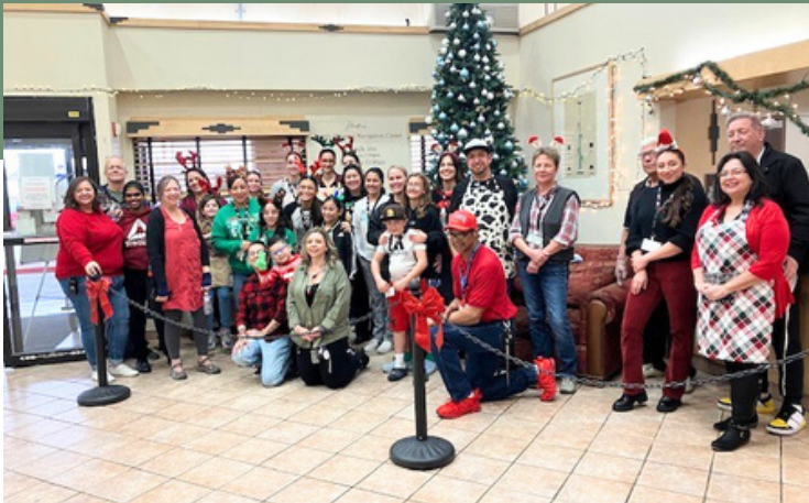
HOLIDAY PARTY, GIFT GIVING & MEAL SERVICE EVENT