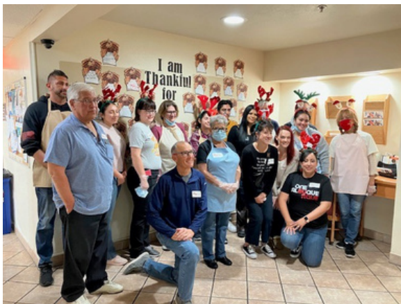
THANKSGIVING DAY MEAL SERVICE AT FAMILY HOUSING NAVIGATION CENTER