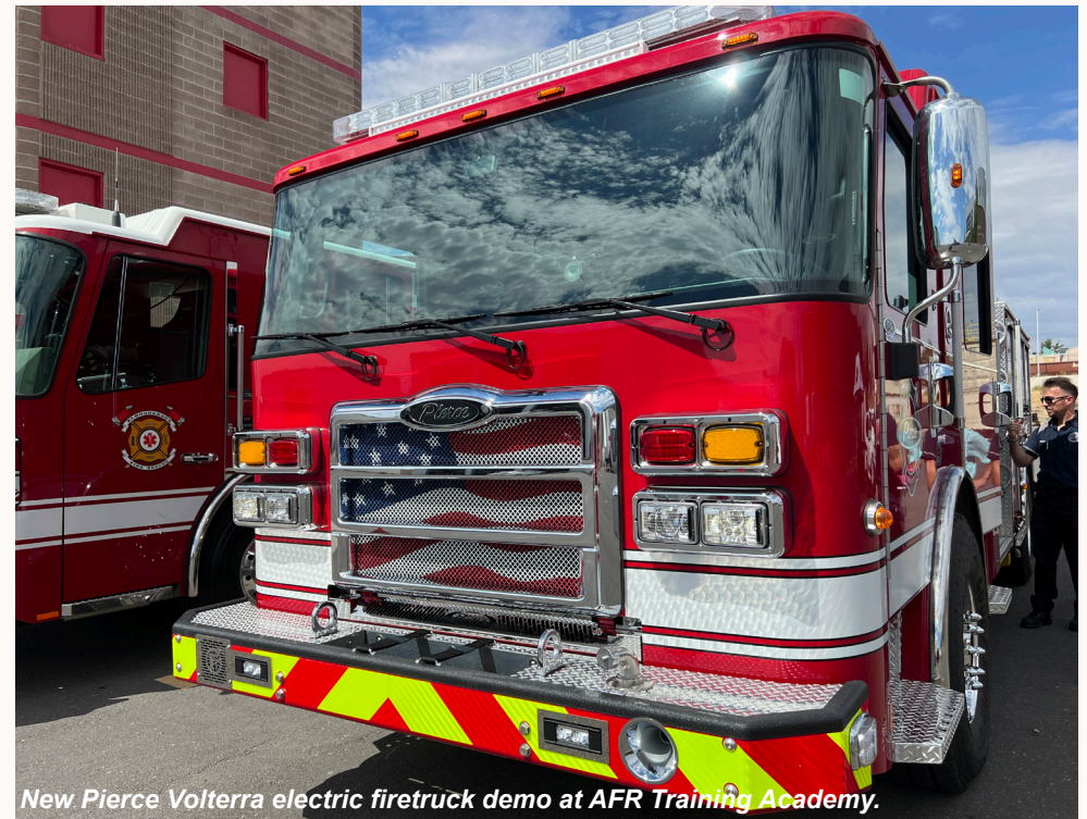
New Pierce Volterra electric firetruck demo at AFR Training Academy.