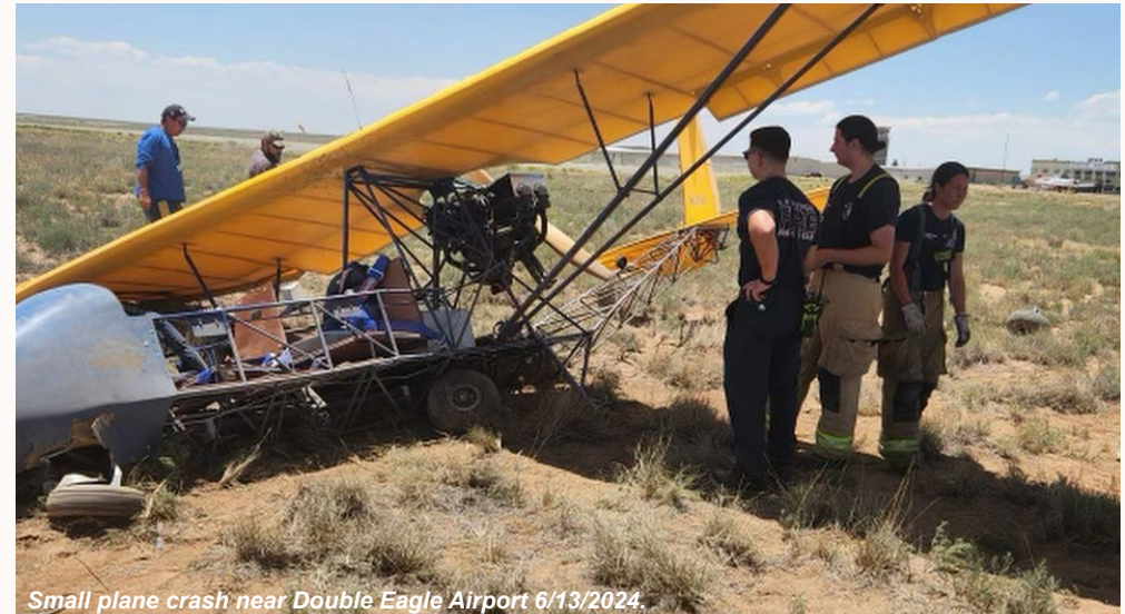
Small plane crash near Double Eagle Airport 6/13/2024.