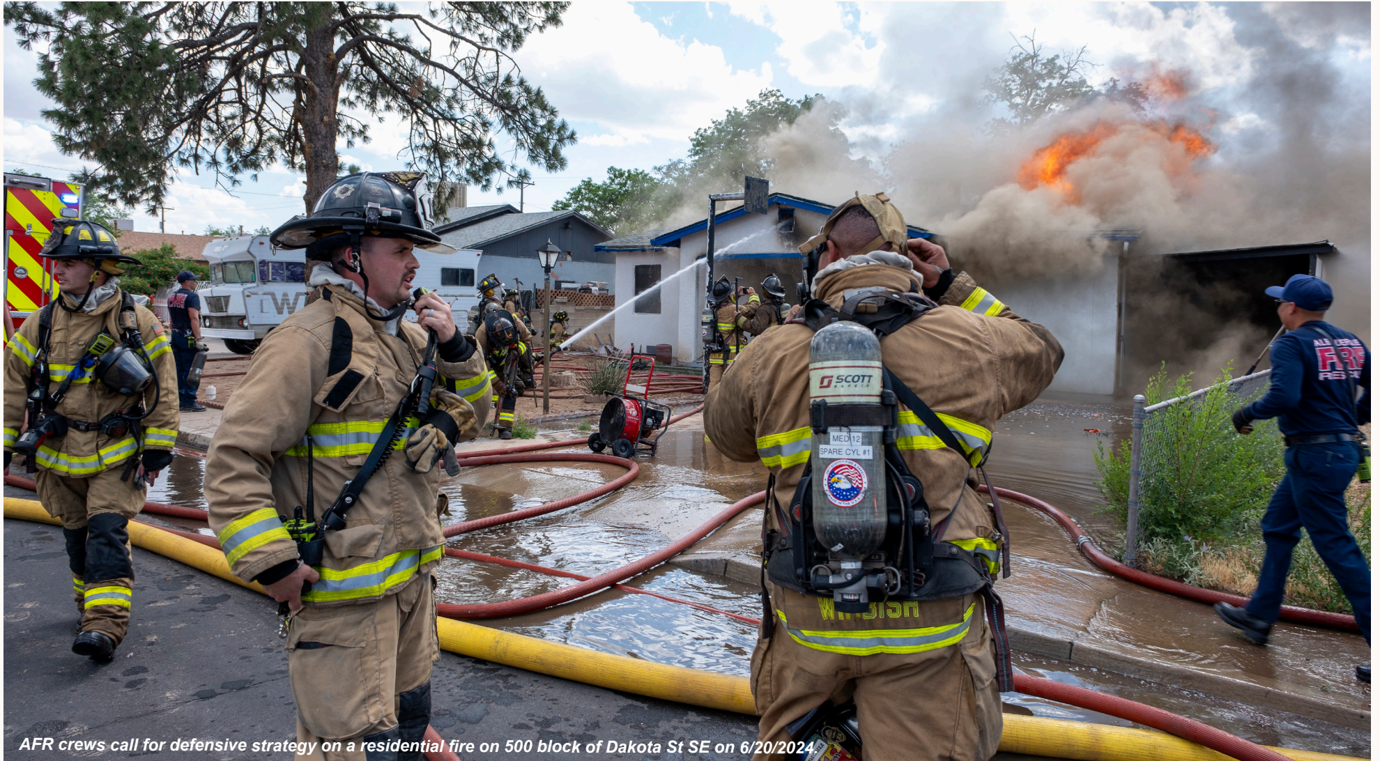
AFR crews call for defensive strategy on a residential fire on 500 block of Dakota St SE on 6/20/2024.

Albuquerque Fire Rescue is transitioning to the P1 CAD software. Call volume data will be delayed until this information is able to be collected.