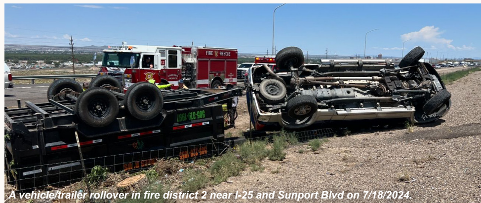
A vehicle/trailer rollover in fire district 2 near I-25 and Sunport Blvd on 7/18/2024.

7/28 - Structure Collapse: At approximately 1235 hours, nine AFR units responded to 10300 Gutierrez Rd. NE in fire district 16 for a partial collapse of a garage at a townhouse due to the weight of the water from a water main break. The single occupant was brought outside to safety but reported a service dog was still missing. AFR Squad 2 drilled holes in the garage door to insert their camera to look for the missing K-9. Unfortunately the K-9 was not found until days later when it was safer to do overhaul and debris removal from the garage and is assumed to have succumbed to injuries during the collapse. AFR, APD PSA's, ABWUA, NM Gas Company and PNM worked together until the scene was safe to turn over to the property owner.