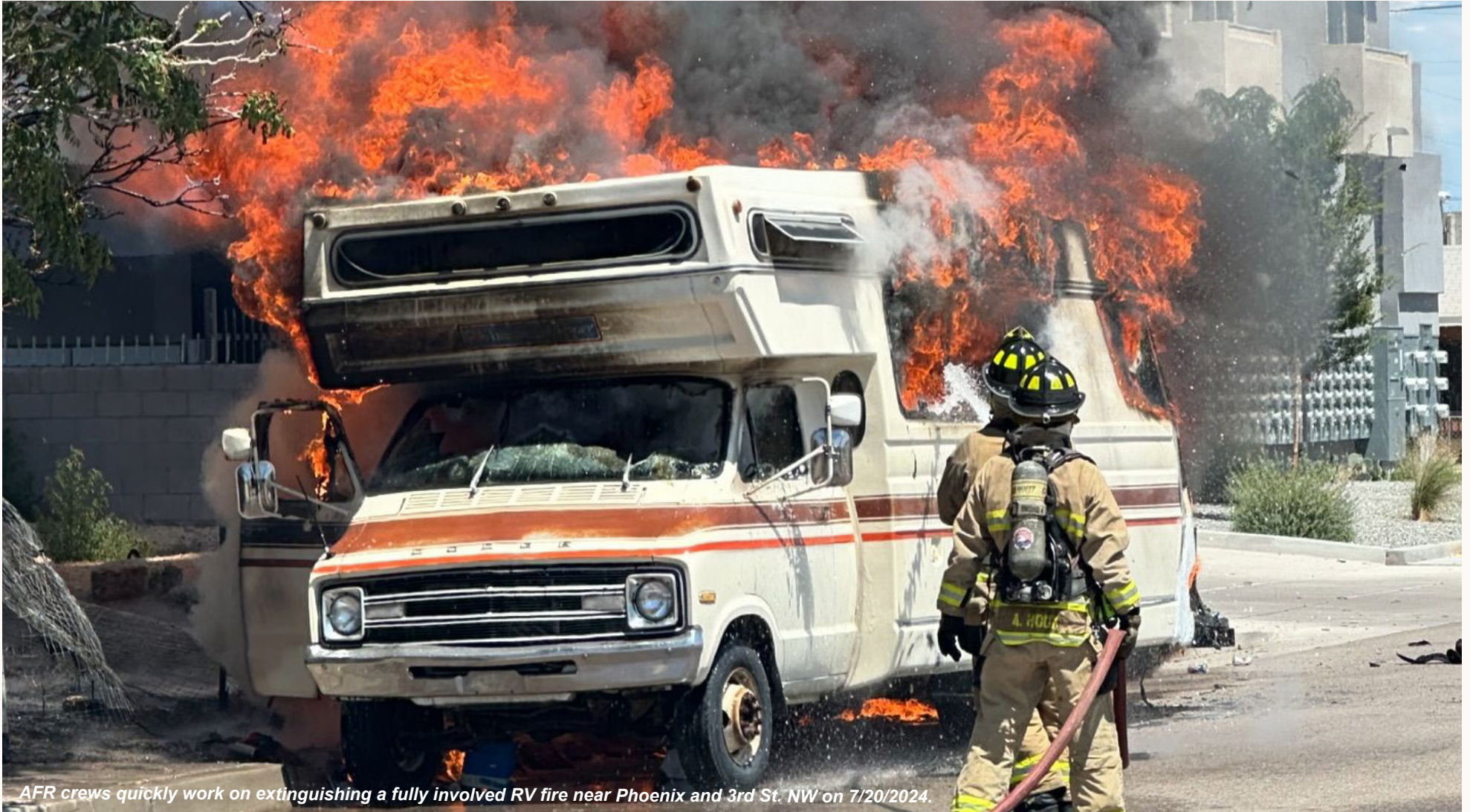
AFR crews quickly work on extinguishing a fully involved RV fire near Phoenix and 3rd St. NW on 7/20/2024.

Albuquerque Fire Rescue is transitioning to the P1 CAD software. Call volume data will be delayed until this information is able to be collected.