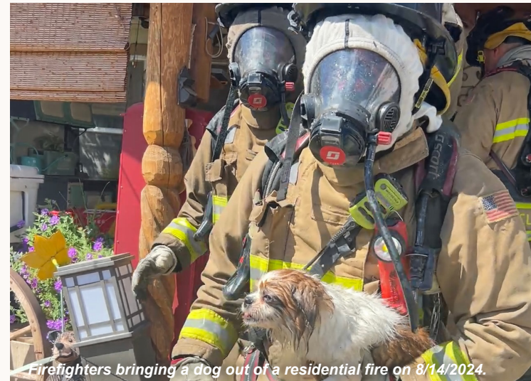
Firefighters bringing a dog out of a residential fire on 8/14/2024.