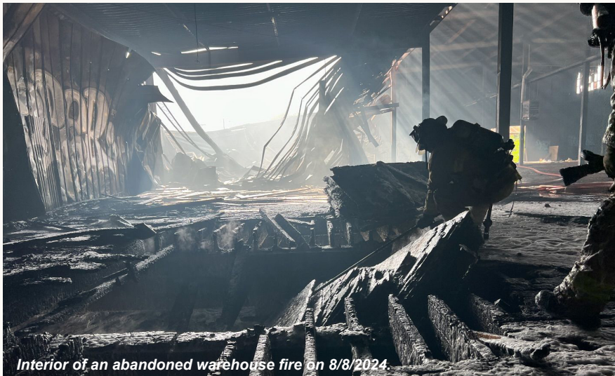
Interior of an abandoned warehouse fire on 8/8/2024.

8/20 - Residential Fire: At approximately 1250 hours, AFR was dispatched to the 7200 block of Carson Trail NW in fire district 18 for reports of a possible structure fire at a two story, single family dwelling. Engine 17 arrived on scene and reported working fire coming from the eaves and attic space. The fire was brought under control within 61 minutes of their arrival. Smoke and water damage to the structure was mostly contained to the fire location. The cause was determined to be accidental due to faulty appliances.