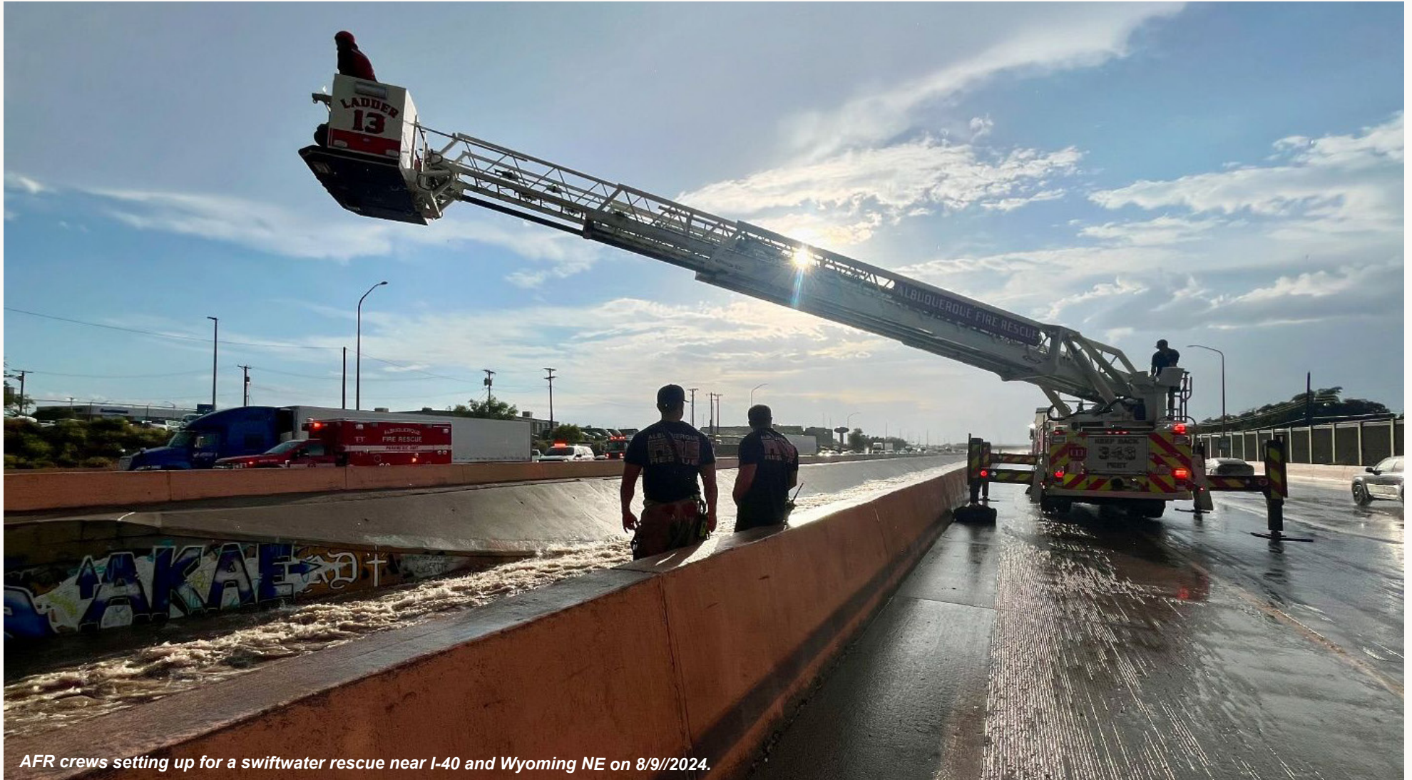
AFR crews setting up for a swiftwater rescue near I-40 and Wyoming NE on 8/9//2024.

Albuquerque Fire Rescue is transitioning to the P1 CAD software. Call volume data will be delayed until this information is able to be collected.