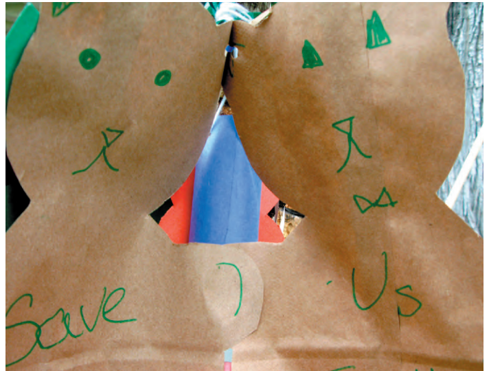
Bear paper dolls made from recycled paper bags!