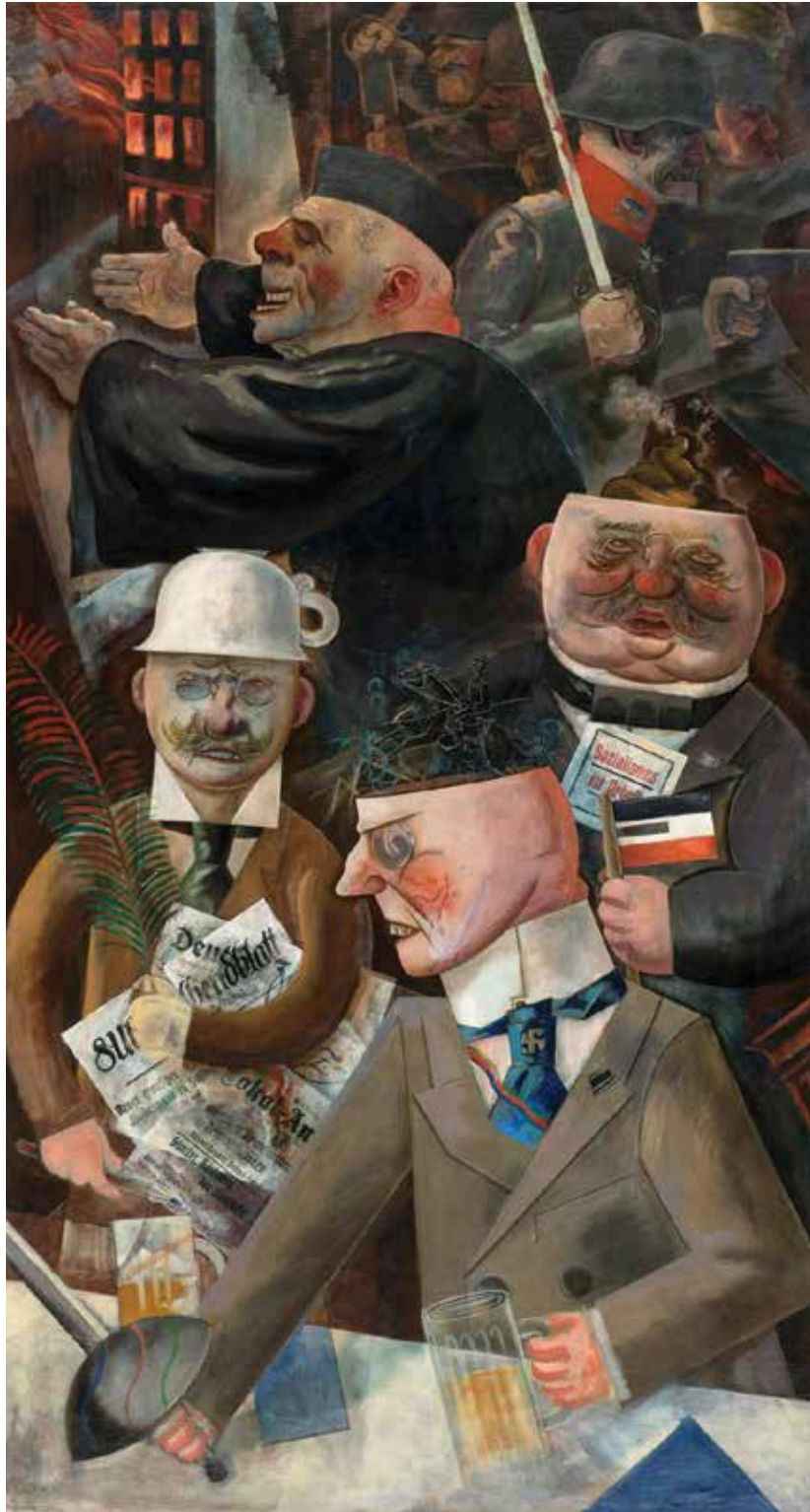
George Grosz, Pillars of Society, 1926, oil on canvas, 29.5 x 15.7

This exhibition is supported by an indemnity from the Federal Council on the Arts and the Humanities.