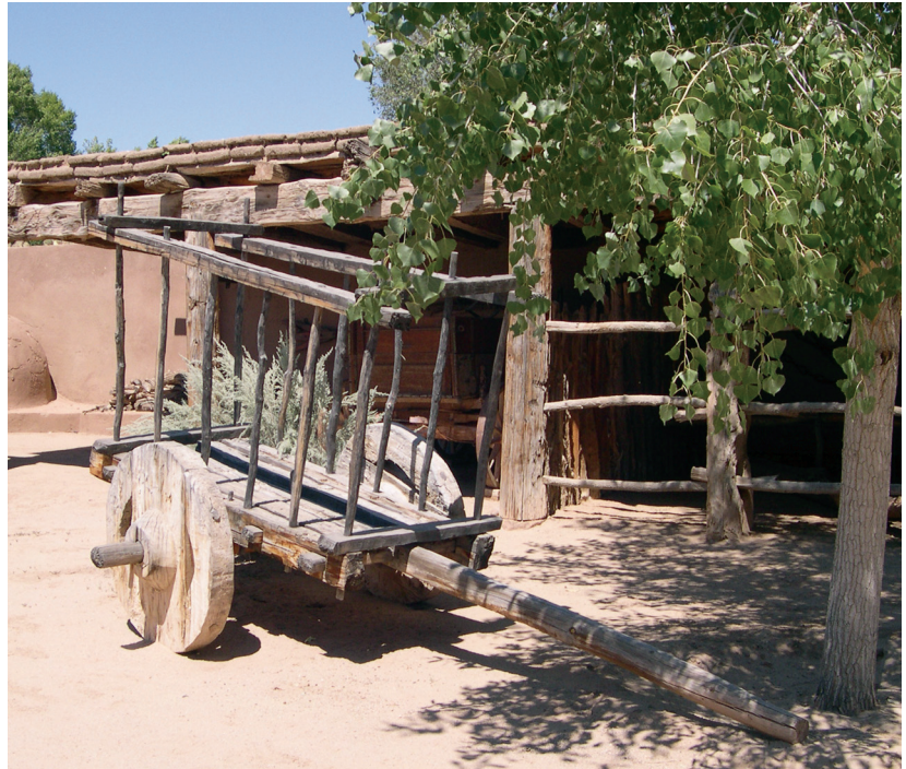
A carreta at historic Casa San Ysidro: the Gutiérrez/Minge House in Corrales, New Mexico.

5. Use tape to attach the handle to the front of the carreta body on the open side.