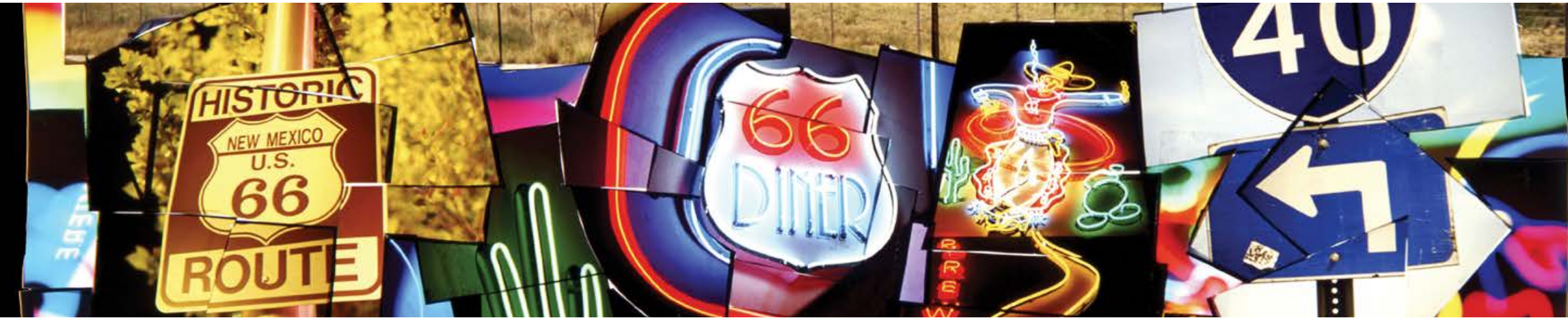
Historic Route 66 Photo Collage