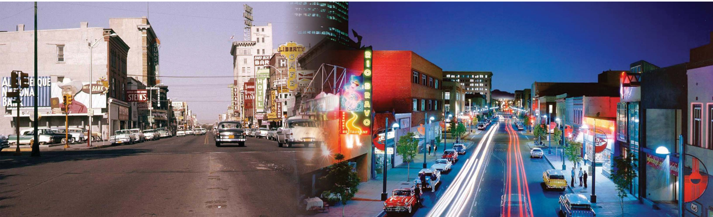
Route 66 in Downtown Albuquerque from 1958 to Present